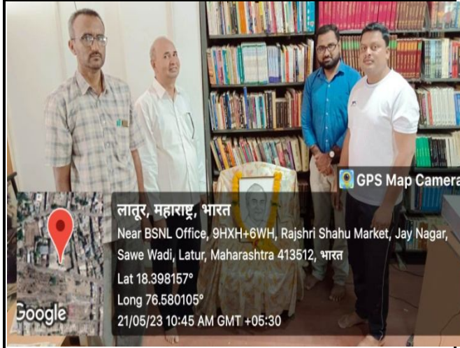
On the occasion of Anti-Terrorism and Anti-Violence Day, teachers and non-teaching staff participated