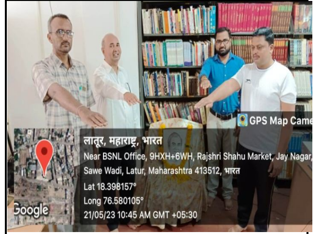
Teachers and non-teaching staff While Taking oath on Anti-Terrorism and Anti-Violence Day